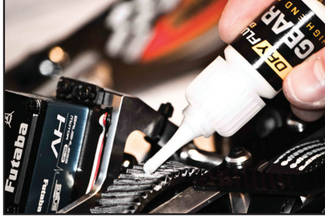
Gear Lube ben-efits in reducing friction and wear on main aears and pinions